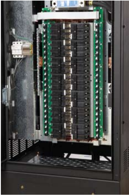
Easily accessible area for bottom cable entry - can be easily rearranged to allow for top entry.