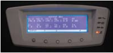
Power consumption trends for up to 23 months can be viewed through a history log - a powerful aid in capacity planning and diagnosis as events are time- and date-stamped as they occur.